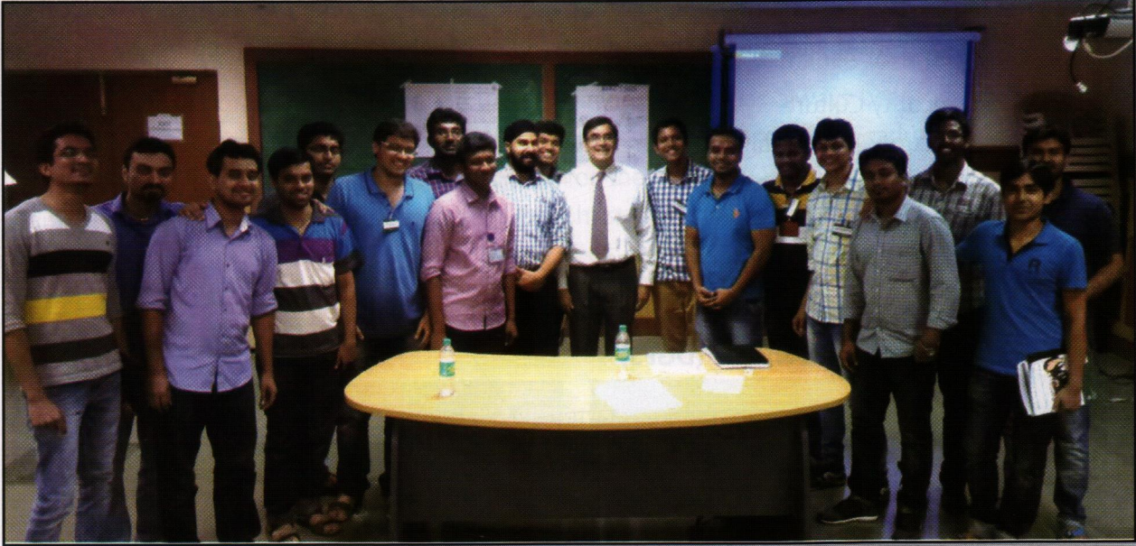
Trainees with Trainer of Softskills Workshop

ओसीईएस 2014 (58 वी बैच) एवं ओसीडीएफ 2014 (11 वां बैच) OCES 2014 (58 th Batch) and OCDF 2014 (11 th Batch)